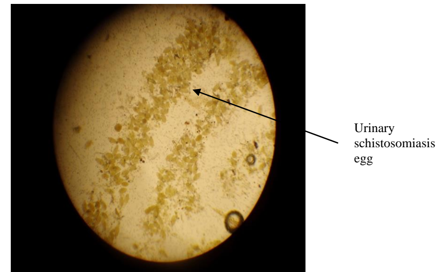
Plate 8: Heavy intensity of Schistosoma haematobium (>50 eggs/10ml urine)

Occurrence of different bacteria isolates in relation to intensity of urinary schistosomiasis infected school-aged children in two Kona settlements.