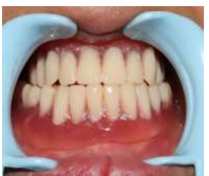
Fig.9 Final prosthesis