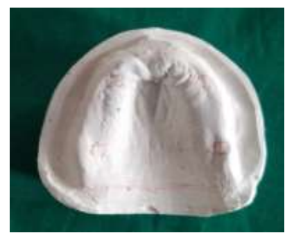
Fig.4 Primary maxillary Cast

training denture base was given desentization. A thin acrylic denture base without teeth was fabricated on secondary cast, and the patient instructed to wear it at home. Following jaw relation, teeth arrangement was done in class III relation. Try-in was done two times for conformation of centric relation record before processing of denture. After final processing, denture was inserted into the patients mouth [Fig.9,10]. Both verbally and in writing, post-insertion instructions were given to her mother. After a day, the patient was called for necessary adjustments, followed by once a week for the first two months, then once every two weeks for the next three months, and finally once a month for the final six months.