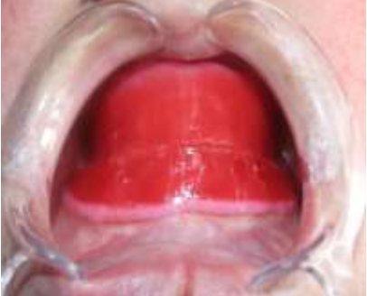
Fig.8 Jaw Relation