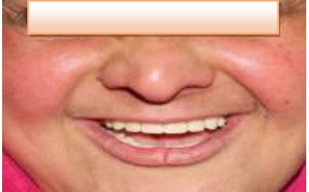
Fig.10 Extra-Oral Post-Operative Photograph