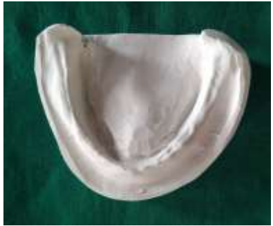
Fig.5 Primary mandibular cast