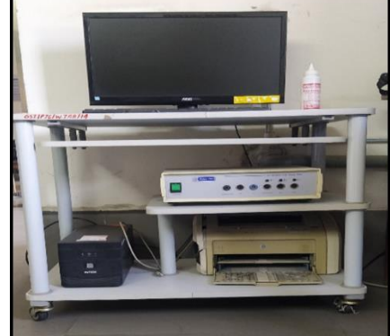
Figure- 1 Materials and Apparatus Used in Study