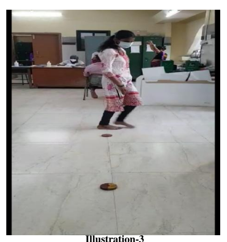
Figure-of-eight walking around obstacles to facilitate obstacle tackling