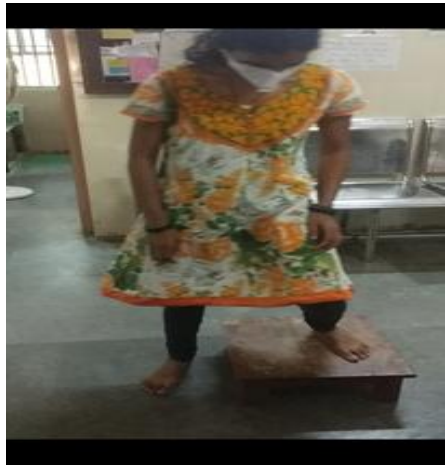
Illustration-2 Lateral step-ups to facilitate motor control

The patient doing trunk rotations to increase her flexibility and reducing truncal rigidity