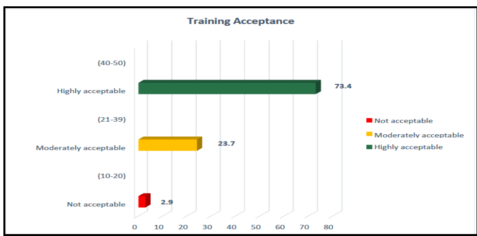
Figure 2: participant's training acceptance for SBT on COLS after training.

In the Figure-2, the Frequency percentage distribution is showing that 2.9% of the GDAs did not accepted the SBT on COLS, 23.7 % of the GDAs gave moderate level of acceptance towards the SBT training on COLS, while 73.4 % of the GDAs gave highly acceptance towards SBT on COLS.