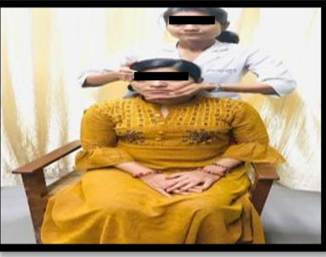
Figure:7 isometric exercise for neck Rotators

5.Scapular retraction:5 sets of 10 repetition.