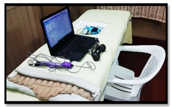
Figure :1 materials used

Assessment form, Consent form, Numeric pain rating scale sheet, Pen, Pencil, Paper, (Stabilizer <sup>TM</sup>, Chattanooga Group Inc., Chattanooga, TN) pressure biofeedback, Plinth, Hot-pack, Sensa-move software (version 2.3), Chair, Bed sheet or towel, Dumbbells of different resistance.