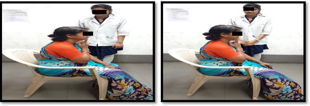
Figure :8 chin tucks

6.Chin tucks: patient position and procedure: sitting or standing, with arms relaxed at the side look straight ahead with the ears directly over the shoulders. Place a middle or index finger on the chin, without moving finger pull the chin and head straight back until a good stretch is felt at base of head and top of neck. Hold for 10 sec. <sup>[28]</sup>