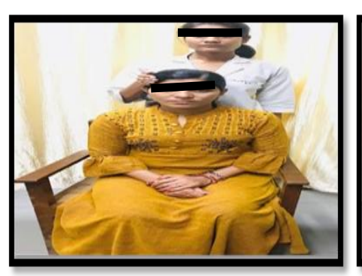
Figure:6 isometric exercise for neck side flexors