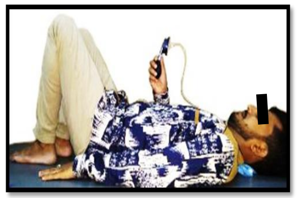
Figure 2: craniocervical flexion training

The final pressure was the one at which the patient could hold 10 sec for 10 repetition. At that pressure training was started for deep cervical flexor muscles,3 sets of 10 repetition. with 2min rest between each set. Along with this all conventional exercise have been given.